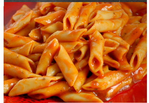
PASTA with Spaghetti/Pizza Sauce Mix

Datassential. Foodservice Summit: Big Ideas Support (Top Line). April 2019.