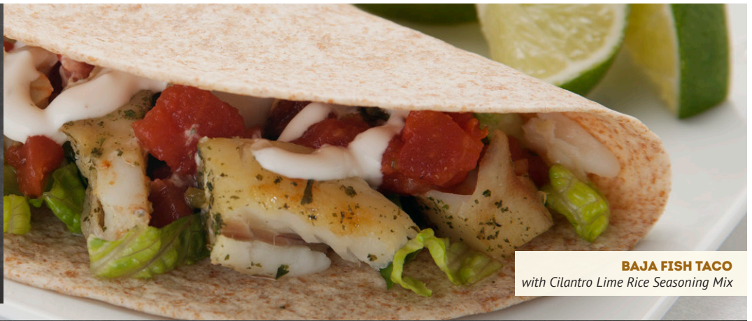
BAJA FISH TACO with Cilantro Lime Rice Seasoning Mix