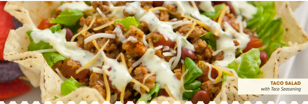
TACO SALAD with Taco Seasoning