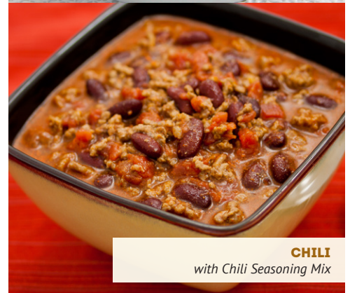
CHILI with Chili Seasoning Mix